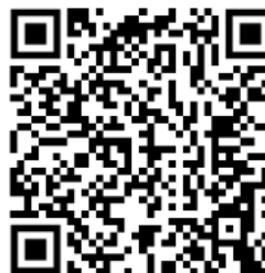
Turn taking ideas