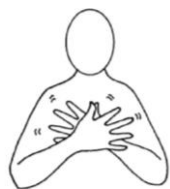
Flutter hands and move them slightly upwards

Alongside this, we will be using objects of reference, picture cards and now and next board to aid communication and understanding. We will be developing focus and attention using our daily attention bucket sessions.