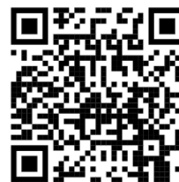
The story of Moses.